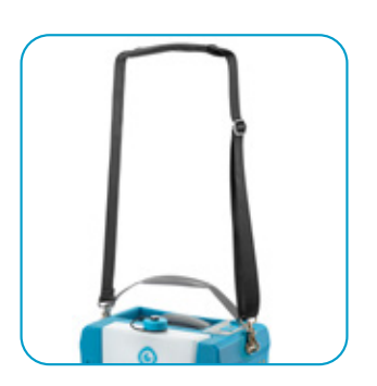
i-cover 1.0 has a removable tank

Better coverage because of specific nozzles, a wide spray fan generates faster cleaning.